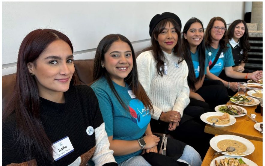
Fellows participated in a Fall Retreat in Denver, CO that transitioned into the Loretto Link Annual Meeting, where they presented about their work for justice at the US/Mexico border in El Paso and networked with Loretto Community and Loretto Link members.

100% of Fellows report that Loretto Justice Fellowship community life programming (Orientation, community meals, Trauma-Informed Practice workshops, Fall Retreat/Loretto Link Annual Meeting) increased both their social justice work skills or knowledge and sense of community .