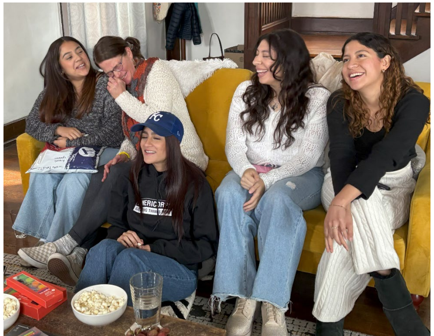
Fellows attend a monthly Community Meal to engage in reflection, learning, connection and sharing.